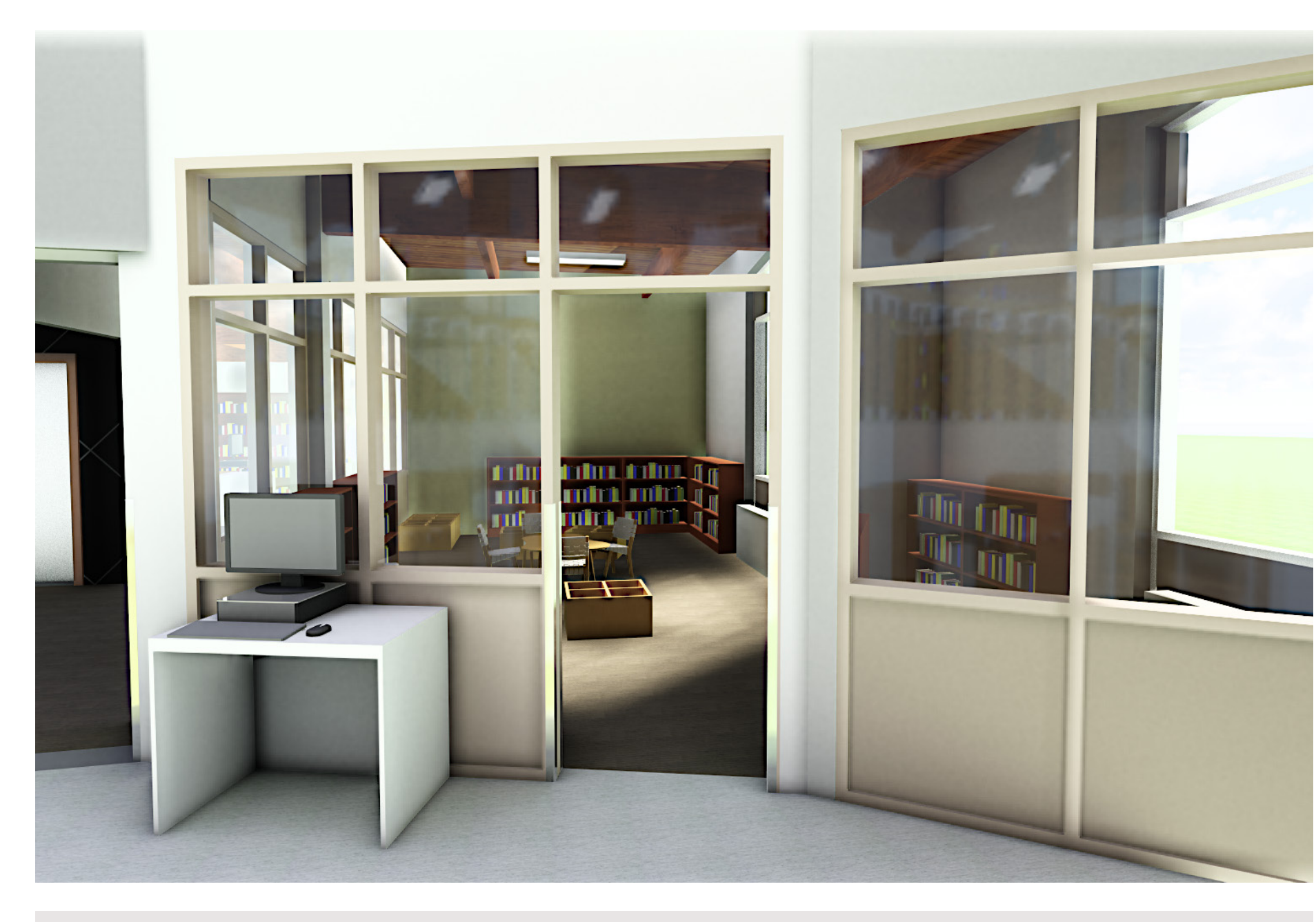
PROPOSED CHILDREN'S AREA ENTRANCE