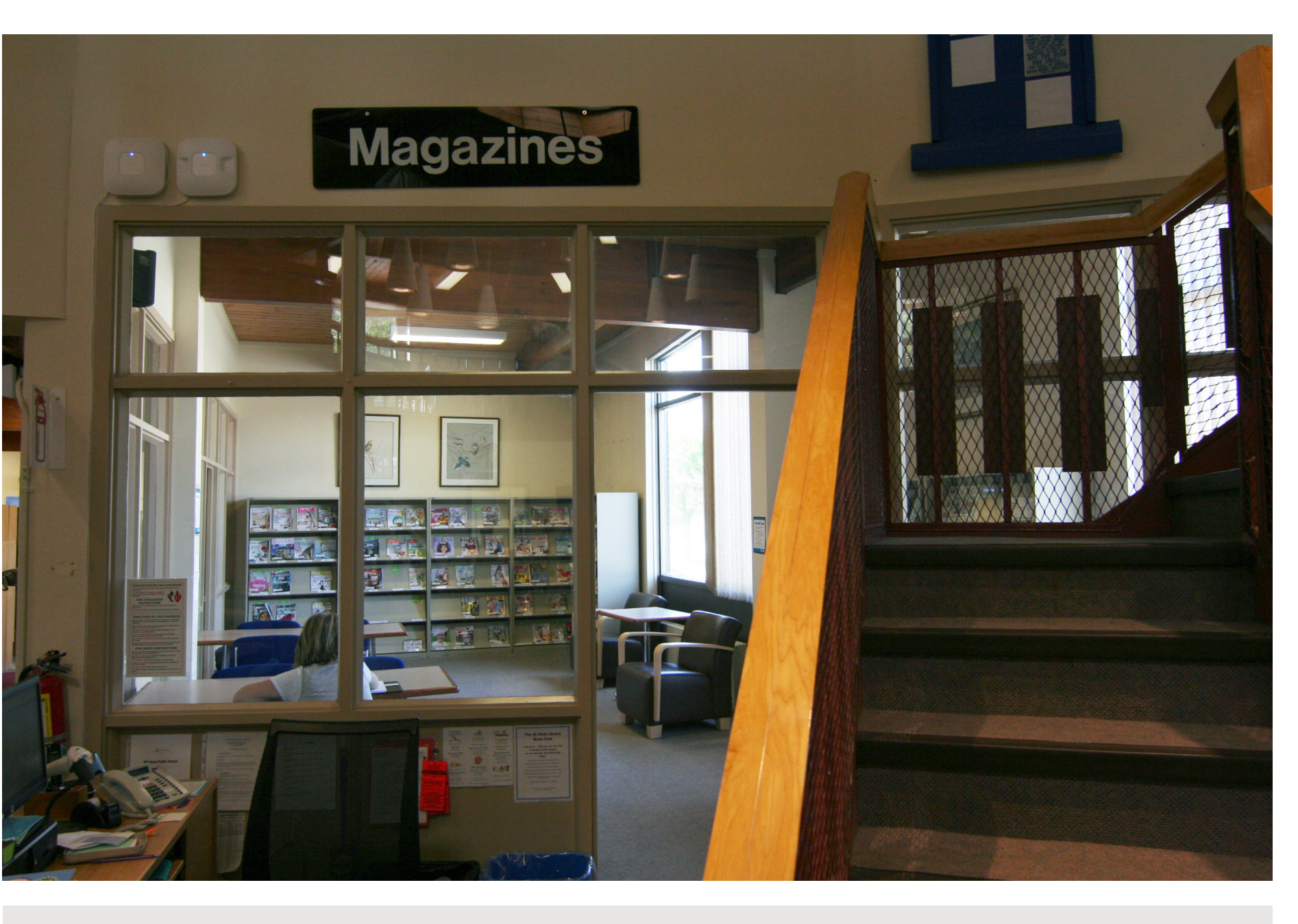
EXISTING MAGAZINE ROOM ENTRANCE