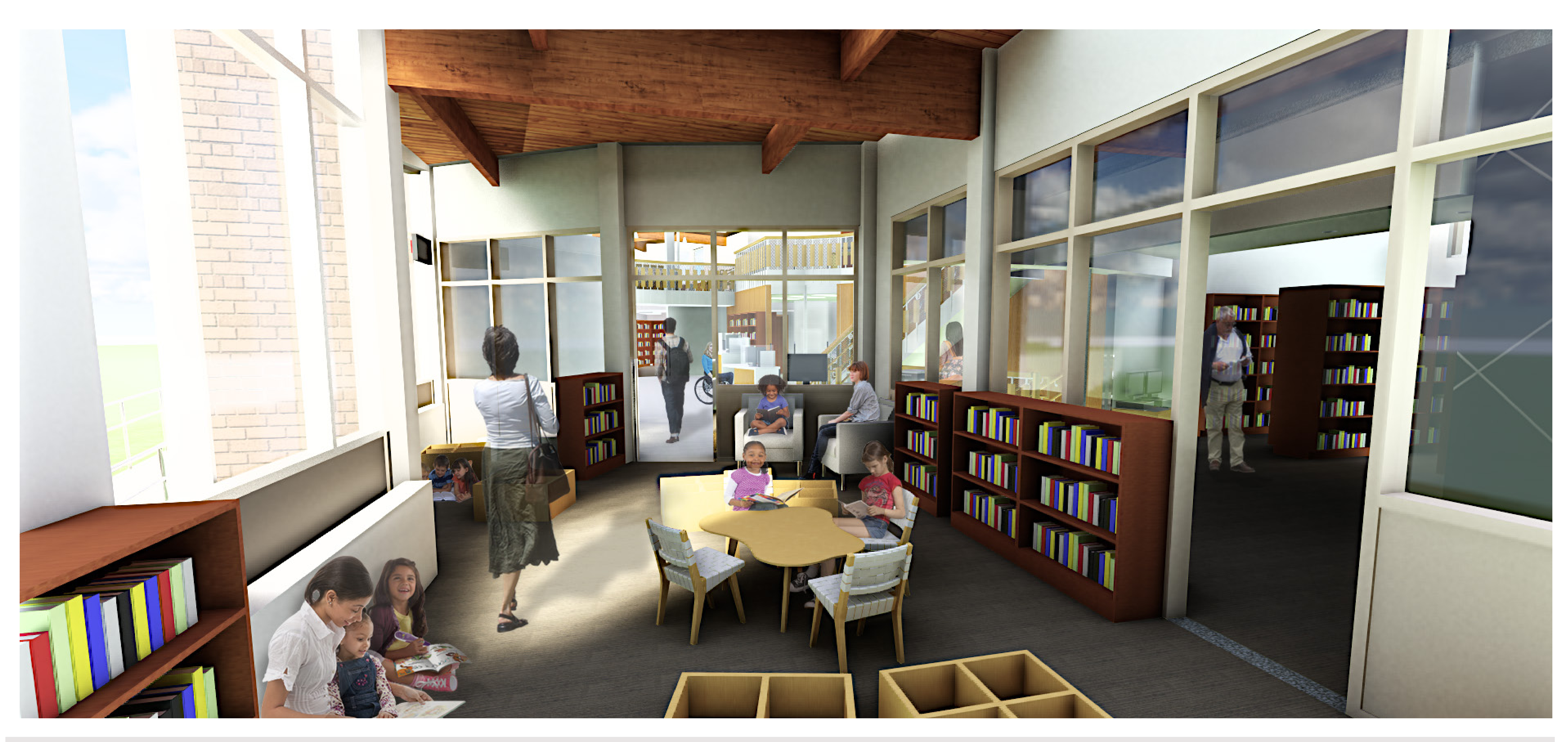
PROPOSED CHILDREN'S LITERACY PLAYGROUND

The existing children's play area is currently located in a small portion of the east rotunda of the library shared with adult books, while additional children's books are located on the mezzanine. The space includes one small table and is in close proximity to the basement stairs.